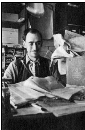
Amity Standard Publisher

The YCHS is looking for a newsletter editor urgently! If you like to edit and do a little page layout, this position is perfect for you.