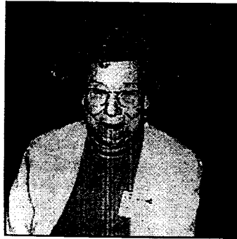
B. White photo

Financial Secty 2430 North Baker McMinnville OR