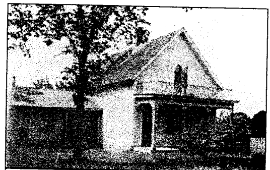
Above is a 1908 photo of one of the homes on the historic house tour. It has since undergone a few design changes....Can you guess which one it is?