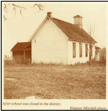
After school was closed in the district.